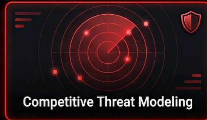
Competitive Threat Modeling

Not a dashboard. A strategic intelligence layer.