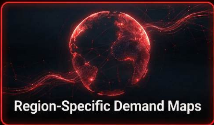
Region-Specific Demand Maps