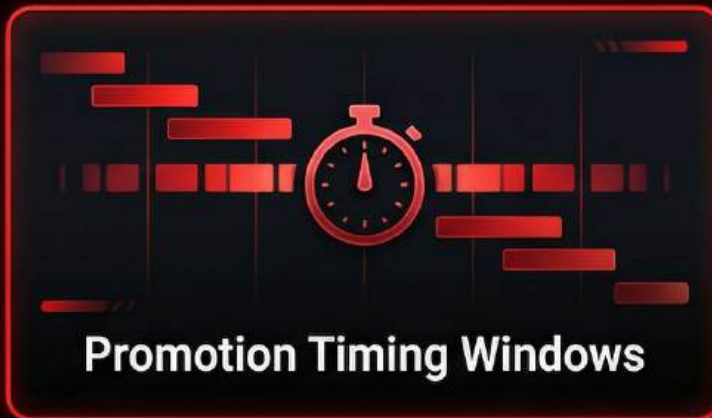
Promotion Timing Windows